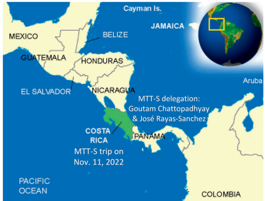
Figure 1. The MTT-S membership drive in San Jose, Costa Rica, took place on 11 November 2022. Costa Rica is geographically located in Central America.

The visit agenda, worked out in close collaboration with the local host, is shown in Figure 2. The activities