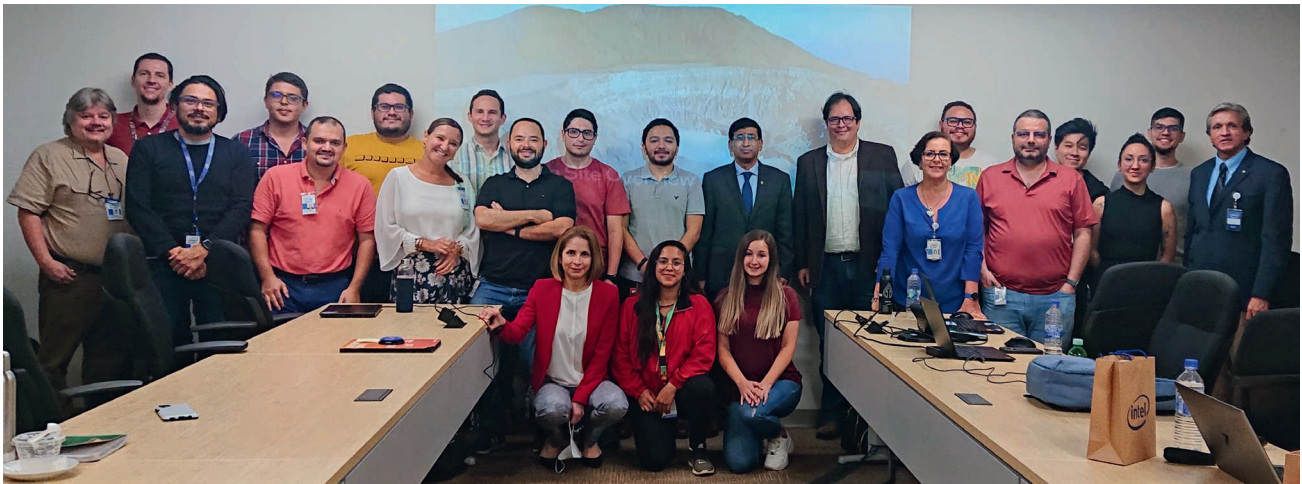
Figure 4. Some of the participants in the MTT-S presentations at Intel Costa Rica.