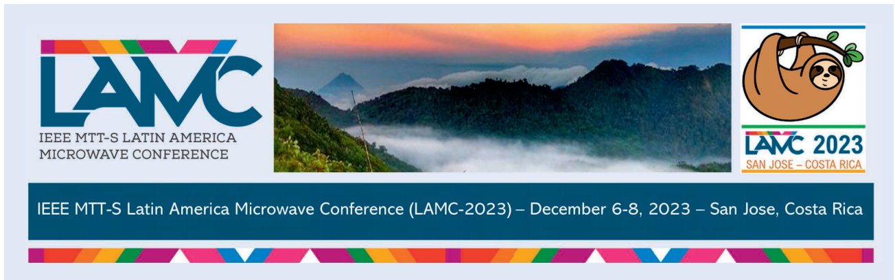
Figure 6. The next MTT-S LAMC is taking place in San José, Costa Rica, on 6–8 December 2023 ( https://lamc-ieee.org/ ).

Center. Figure 3(b) shows Goutam Chattopadhyay presenting the MTT-S goals, technical activities, and various offerings to its members. The status of the MTT-S in Latin America and a specific proposal for Costa Rica were presented by José Rayas-Sánchez [see Figure 3(c)]. A group photo showing some of the engineers participating in the MTT-S presentations at Intel Costa Rica is shown in Figure 4.