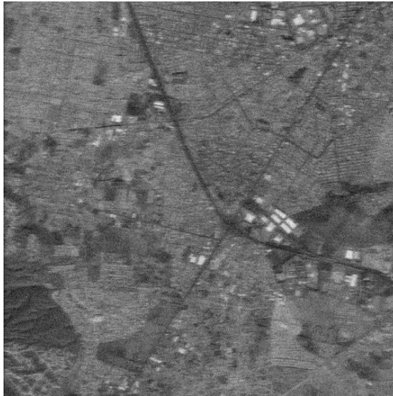
Figure 3. Simulation results: reconstructed aggregated fused image.