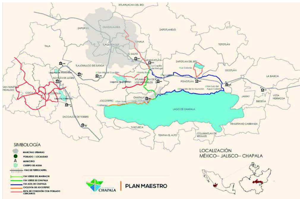
Figure 1: Location of greenway projects

The Master Plan Vía Verde del Mariachi 1 seeks to recover the memory of the old railroad route whose aim was to reach the port of Chamela in the Pacific Ocean. The construction began in 1917 completing only a stretch of 31 km., which partially ran for a period of about 10 years, between 1928 and 1929 the service was canceled and then the track dismantled. The original route is composed of roads and trails and crosses plots of land in 4 communal regions, involving three municipalities of the State of Jalisco, located to the west of the Metropolitan Area of Guadalajara. (See figure 1)