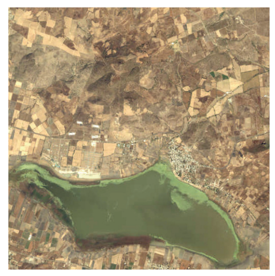
Figure 1. Original high-resolution RS scene.