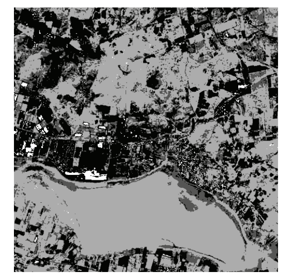
Figure 3. HRSS map extracted using the MDM method.