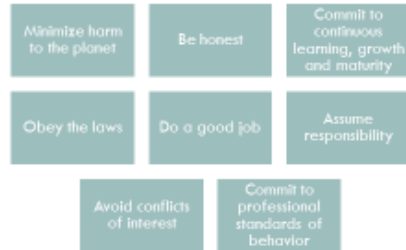
Figure 1. Guiding Principles (Pells, 2012)