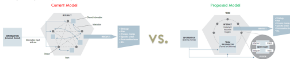
Figure 2. Decision Making models (Devlin, 2012)