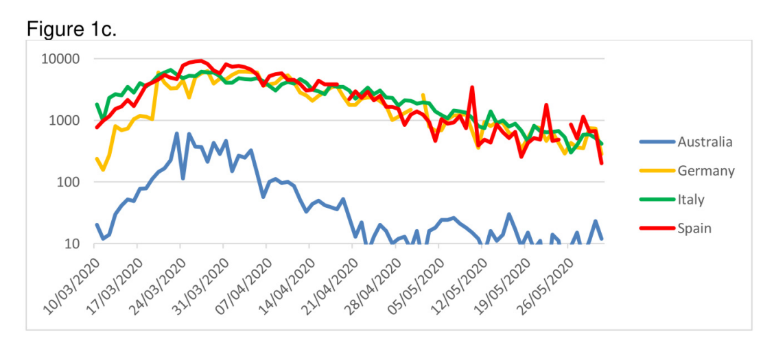
Figure 1 . Logarithmic scale visualisation of daily new confirmed COVID-19 cases from 10/03/2020 to 31/05/2020. Figure 1a: India, Kenya, Mexico, and South Africa. Figure 1b: Canada, Sweden, and the U.K. Figure 1c: Australia, Germany, Italy, and Spain. (Source of data: Our World in Data).