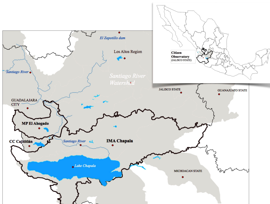
Fig. 1. Location of case studies

So far, water supply has been the top priority in water policy in the Santiago River watershed. Despite efforts by the state and federal water authorities to develop infrastructure to satisfy the fast growing urban and agricultural demand for water, the infrastructure has so far been unable to cover this demand (Wester et al. 2009). In Guadalajara city, the population has grown by 49% over the last 20 years and has reached 4.4 million; industrial and rural development have further amplified the pressure on water resources. The “green” area the city depends on for its water supply has expanded from local springs and aquifers to include lakes and rivers within a 90-km radius; the regional water balance and the distribution of water rights in the basin is rapidly changing (López-Ramírez and Ochoa-García 2012). In the meantime, wastewater discharge is left untreated, hydro-ecosystems continue to deteriorate, wetlands are drying up, biodiversity is depleting, people living near the rivers are increasingly facing health problems, and water-related sociocultural practices are disappearing (McCulligh et al. 2016; Tetreault et al. 2012). Embedded in this context, social conflicts take place at different levels of water governance. Every local conflict has a particular context, dynamics, and spatial